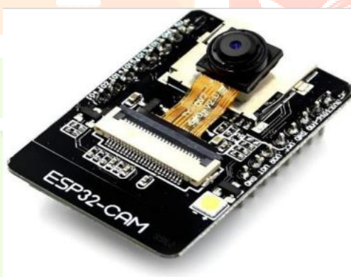
fig.2.ESP 32 CAM module