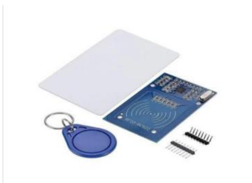
fig.1. RFID reader writer module