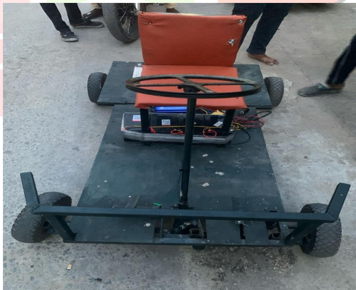
Figure 5.1 Final Image of Go-Kart