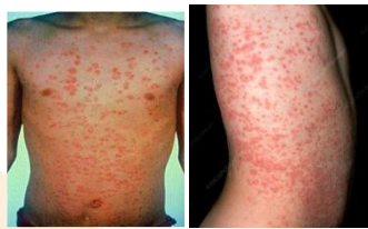
Figure no. 1.4 showing the picture of Guttate Psoriasis

Guttate Psoriasis- It is characterized by copious small oval (teardrop- shaped) spots. They appear over large areas of the body, such as the trunk, limbs, and scalp. Guttate psoriasis is associated with streptococcal throat infection 17 [8,5].