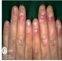
Figure no. 1.3 showing the picture of Nail Psoriasis

Guttate Psoriasis- It is characterized by copious small oval (teardrop- shaped) spots. They appear over large areas of the body, such as the trunk, limbs, and scalp. Guttate psoriasis is associated with streptococcal throat infection 17 [8,5].