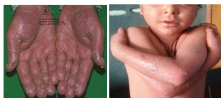
Figure no. 1.6 showing the picture of Erythrodermic Psoriasis

Erythrodermic Psoriasis- It involves the extensive inflammation and exfoliation of the skin over most of the body surface and may be accompanied by severe itching, swelling and pain. It is often the result of an exacerbation of unstable plaque psoriasis, particularly after the abrupt withdrawal of systemic treatment. This type of psoriasis may be fatal, because more rigorous inflammation and exfoliation disturb the body's ability to regulate temperature and for the skin to perform barrier functions 19 [5,10].