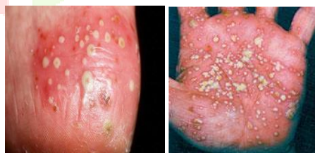
Figure no. 1.2 showing the picture of Pustular Psoriasis

Pustular Psoriasis: It appears as raised bumps that are filled with non- infectious pus (pustules). The skin under and nearby pustules is red and tender. Pustular psoriasis can be seen in localized, commonly to the hands and feet, or generalized with widespread patches occurring randomly on any part of the body 15(6-5)