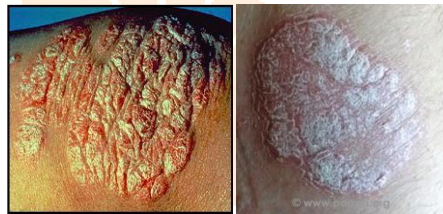
Figure no. 1.1 showing the picture of plaque Psoriasis

Plaque Psoriasis (Psoriasis vulgaris): It is the most common form of psoriasis. It affects majority of people with psoriasis. Plaque psoriasis typically appears as raised areas of reddened skin covered with silvery white scaly skin. These areas are called plaques 14